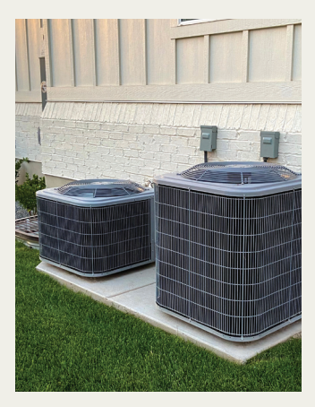
Seller HVAC Option