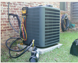
Pre-season HVAC tune ups