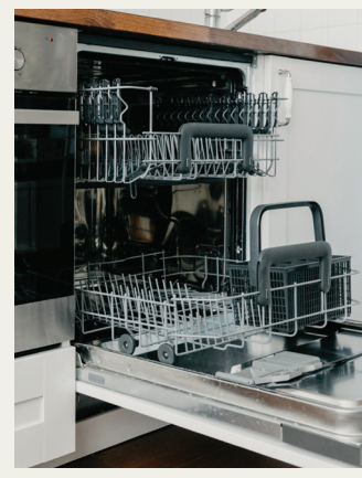
Discounts on new appliances