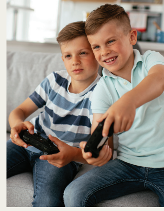
Electronics Protection Plan